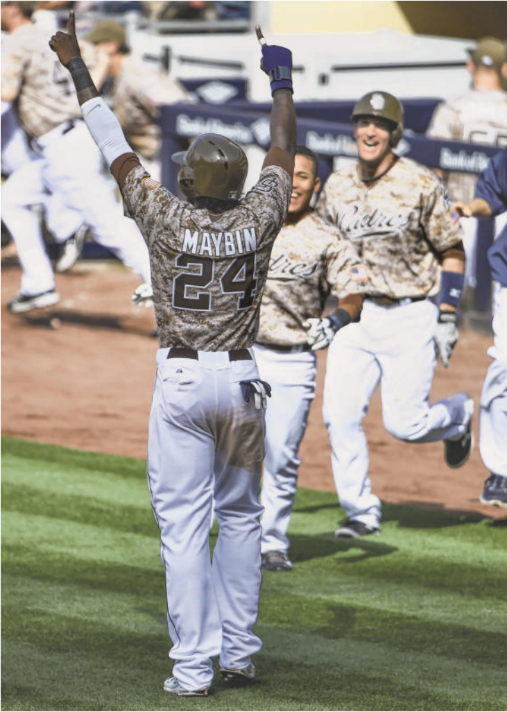
The Padres' Cameron Maybin celebrates after scoring the winning run during the ninth inning at Petco Park on Sunday.

Even with all the factors turning out right, Black said it was "a pretty standard procedure in that situation, game-winning run. Worse-case sce-