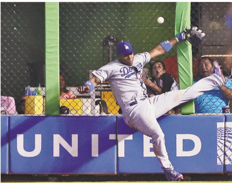
Dodgers right fielder Yasiel Puig slams into the fence trying to catch Jeff Baker's two-out game-winning RBI double in the ninth inning at Miami. Puig was shaken up on the play.