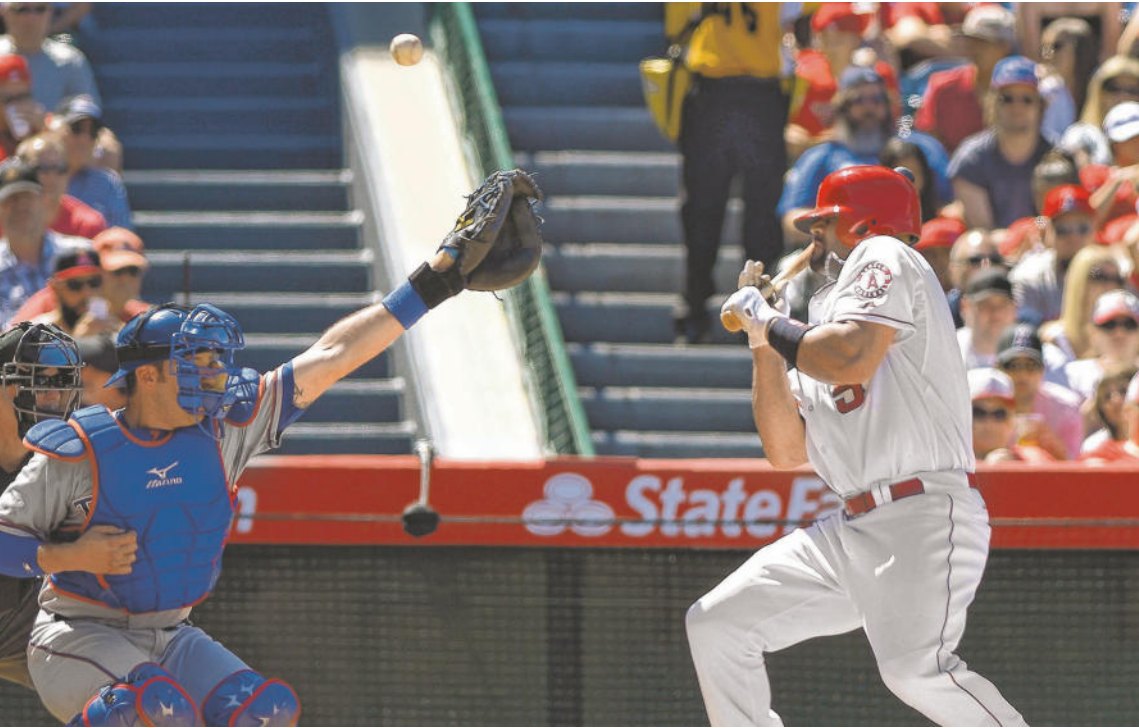
The Los Angeles Angels' Albert Pujols, right, is hit in the head by a pitch thrown by Texas Rangers starting pitcher Yu Darvish, of Japan, as catcher J.P. Arencibia, second from left, looks on during the fifth inning.

"I was just happy to drive in a couple of runs, because that's a big part of my game. I haven't been pressing, but anytime you're not doing what you know you can do, it's definitely frus-